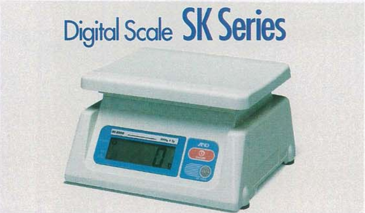
Digital Scale SK Series

Unlimited applications, hardware stores, roadside stands, offices, industries, warehouses.