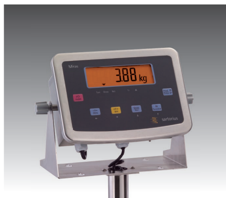
Rechargeable Battery Version

L=15000d, 10 g readability L9=rechargeable battery version